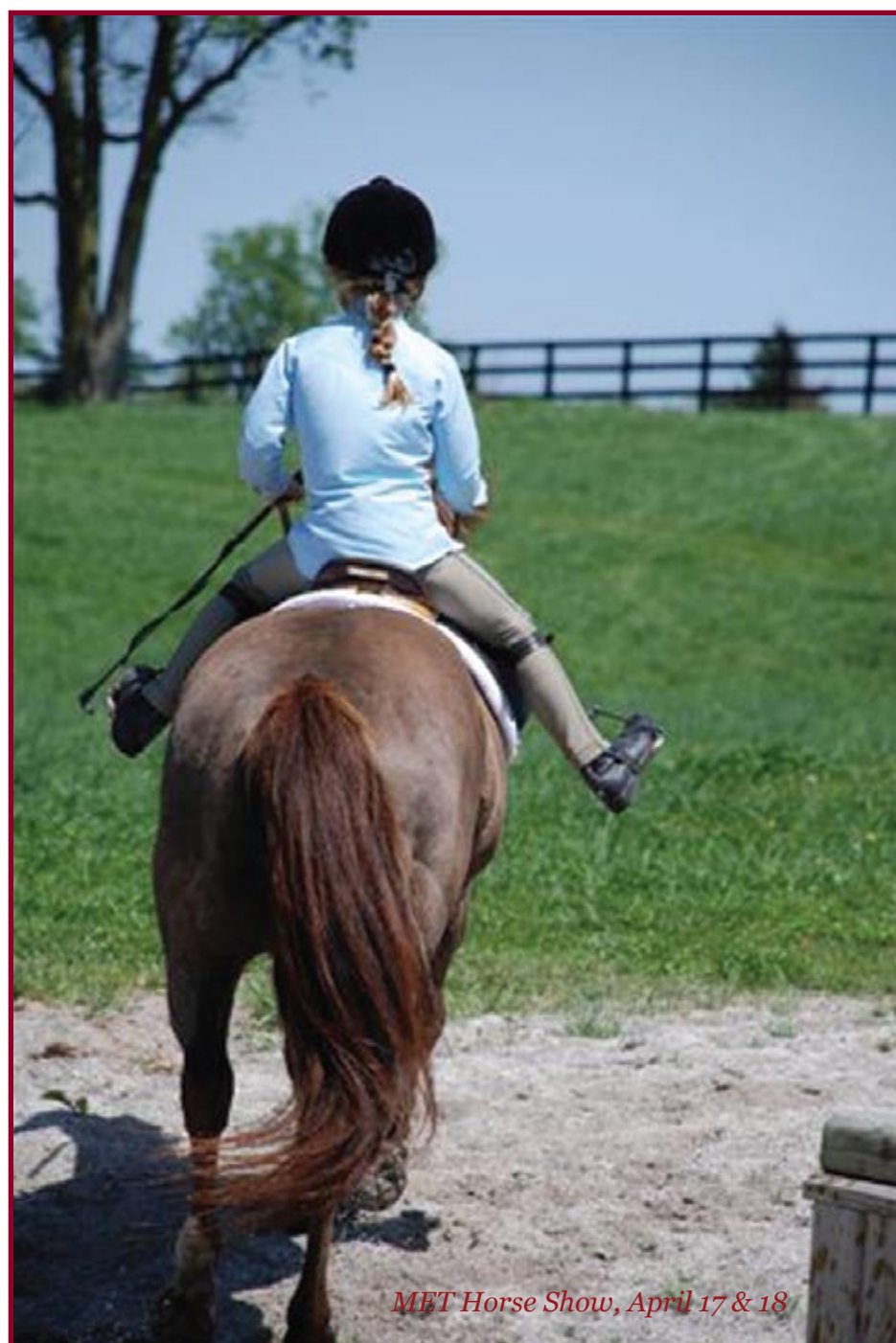
MET Horse Show, April 17 & 18