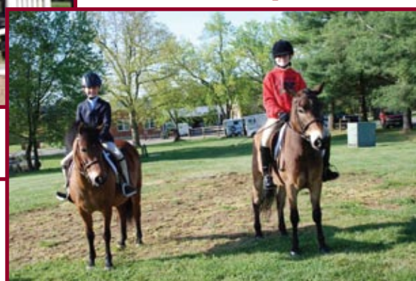
Cross Country Schooling Day, May 23