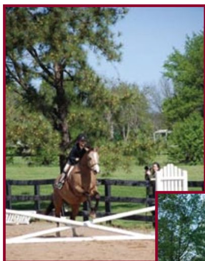
MET Horse Show, April 17 & 18